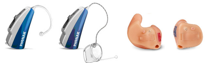
Fig. 1: Illustration of the Phonak CROS BTE and ITE transmitter options. Due to its high degree of flexibility, Phonak CROS can be combined with any type of Spice hearing instruments.

The different CROS transmitter styles are shown in Figure 1.