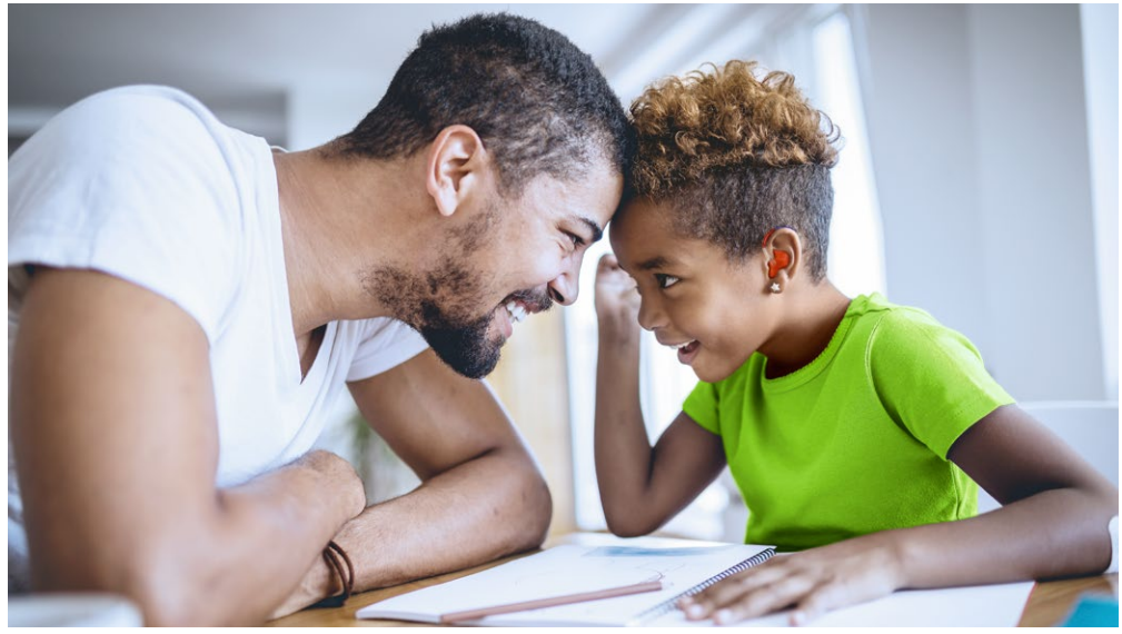
<sup>2</sup> National Scientific Council on the Developing Child. (2004). Young children develop in an environment of relationships. Retrieved from https://46y5eh11fhgw3ve3ytpwxt9r-wpengine.netdna-ssl.com/wp-content/uploads/2004/04/Young-Children-Develop-in-an-Environment-of-Relationships.pdf, accessed August 19th, 2019

Mealtimes can pose a real challenge. Keeping up with dynamic conversations is made especially hard due to the complex mix of voices, background noise and clinking cutlery. For a child to be an active participant in a conversation, they need to hear everyone at the table clearly.