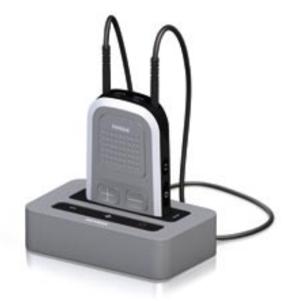
Phonak ComPilot with Phonak TVLink S basestation

Please ask your hearing care professional to show you what the amazing Phonak wireless accessories can do.